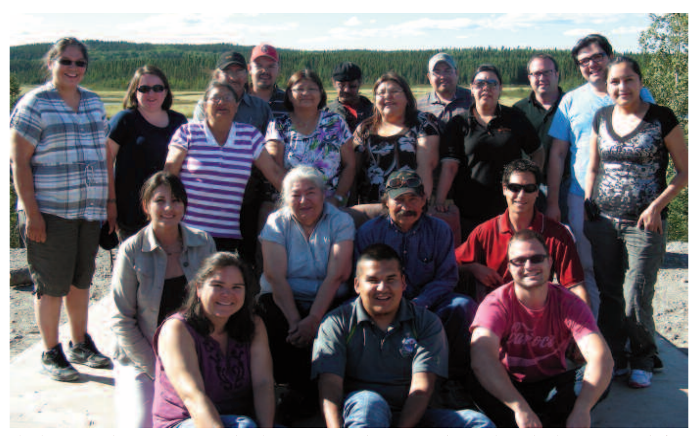
The direction and initiatives proposed in the Organizational Operating plan are driven by the COTA Board of Directors, staff, and members.

And lastly, because the plan is continually reviewed and updated, there is less need to develop a comprehensive (and costly) new plan every 5 years. At any time, funders can be provided with a snapshot of the plan, showing 3 to 5 years of initiatives with corresponding work plans and budgets.